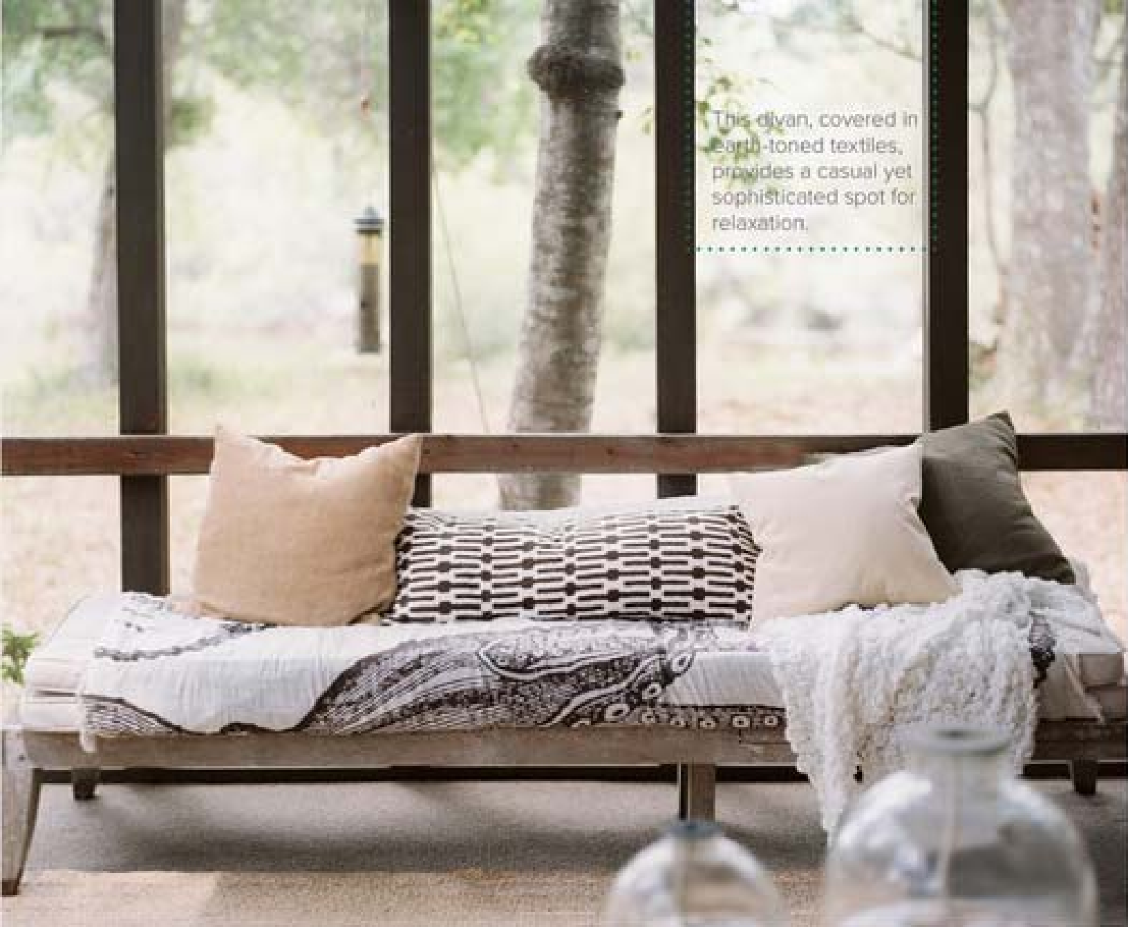
This daybed, covered in earth-toned textiles, provides a casual yet sophisticated spot for relaxation.