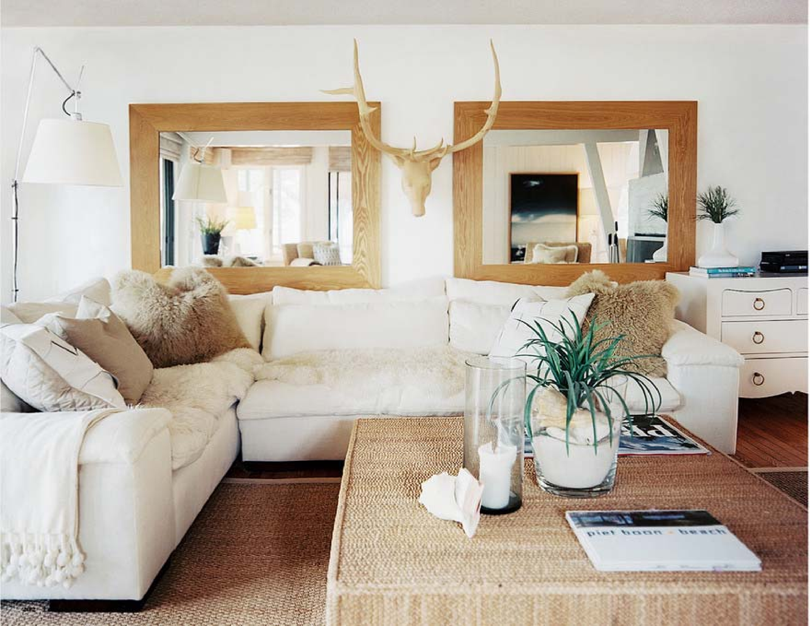
Sherry's neutral-toned living room is invigorated by a clever blend of woven textures.