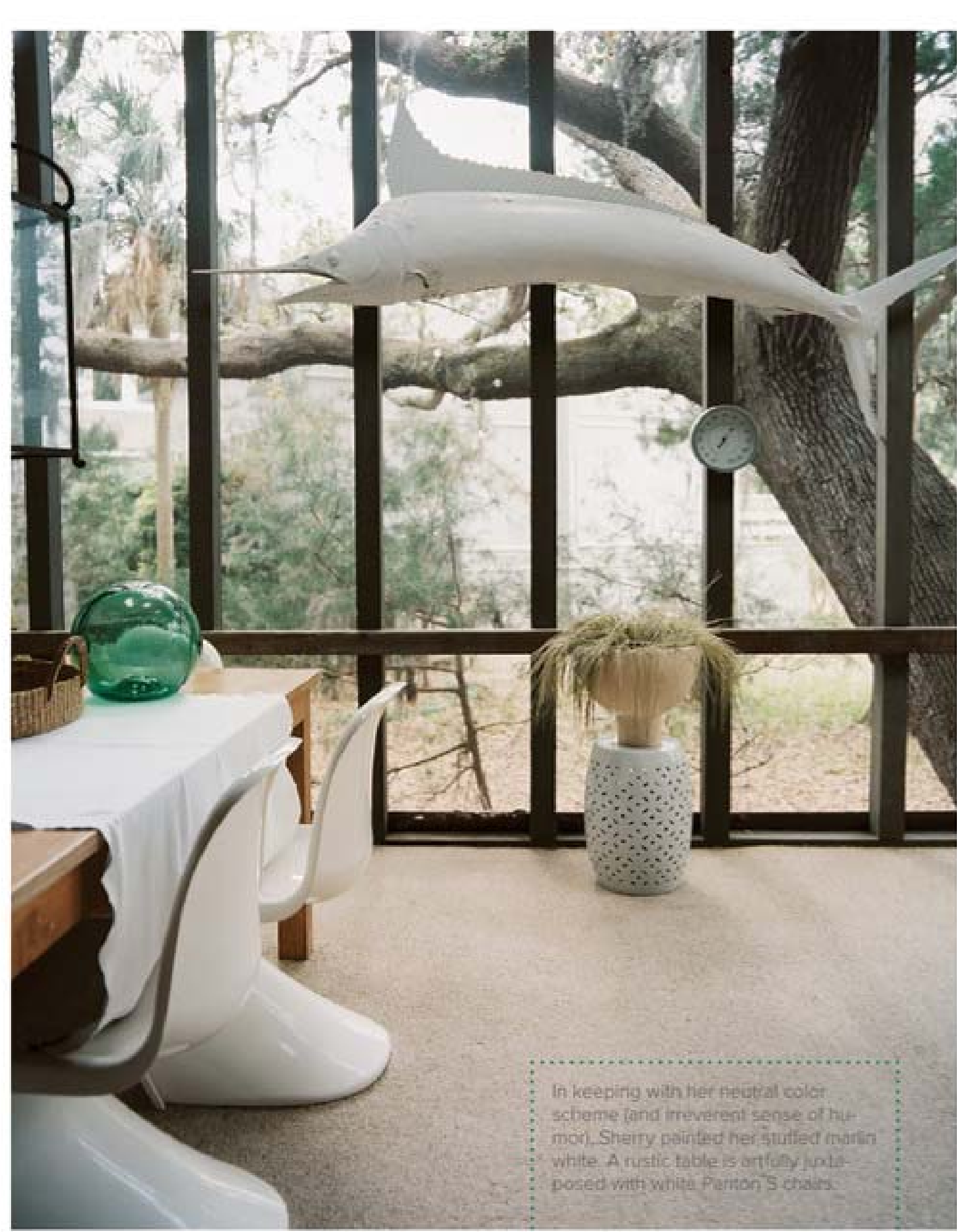
In keeping with her neutral color scheme (and irreverent sense of humor), Sherry painted her stuffed marlin white. A rustic table is artfully juxtaposed with white Perron S chairs.