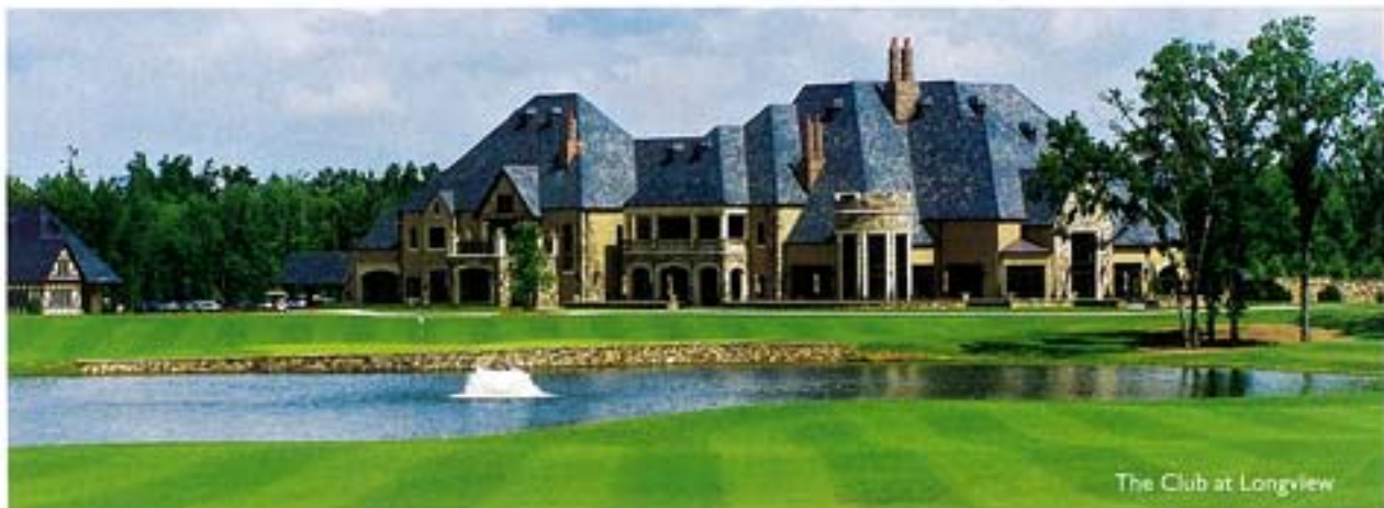
The Club at Longview