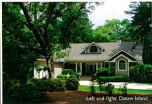
Left and right: Dataw Island