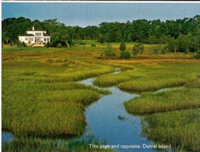
This page and opposite: Daniel Island