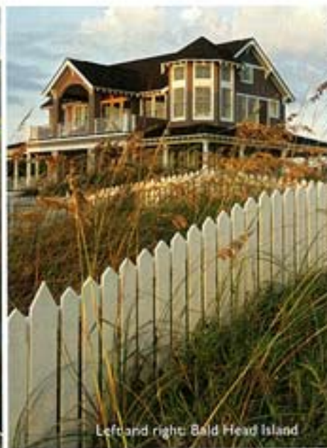
Left and right: Bald Head Island